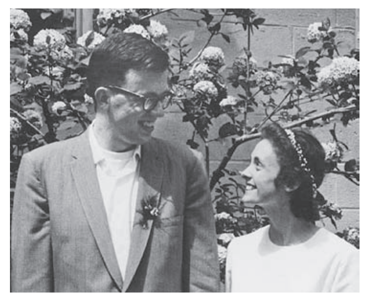
The author and his wife on their wedding day

from work, however, they all wanted to go outdoors again and play with me, so we often ended up romping in the garden. Afterwards, Verena had to clean up the children all over again, which she did, though not without a little justified grumbling.